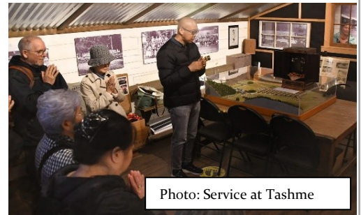
Photo: Service at Tashme

I visited the Tashme internment site in B.C. along with thirty-four Vancouver Buddhist Temple members on August 24 th . It was a day trip to visit the site and museum, which was funded by the VBT and the JCLS (Japanese Canadian Legacy Society). Tashme was established in 1942, by the Canadian federal government, as one of several sites to incarcerate Japanese Canadians during World War Two. At its peak, Tashme was home to 2,644 Japanese people. At the museum, we watched a short documentary film about life in BC interment camps, as well as in Tashme. I cannot imagine the difficulty and worries that Japanese Canadians must have experienced. It is too easy for us to take for granted that we are able to attend services or make manju (pastries) for fundraisers. We should not forget that we are able to continue gathering at our temples, and listen to the Buddha-Dharma because of the efforts and sacrifices of these early pioneers.