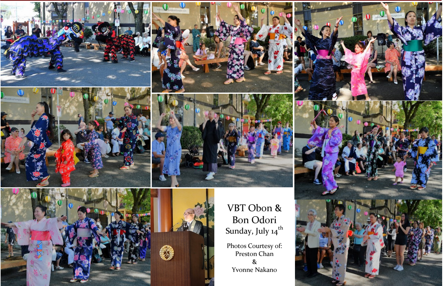
VBT Obon & Bon Odori Sunday, July 14 th