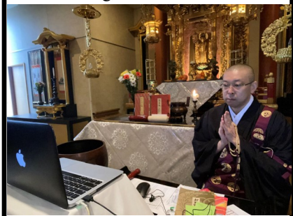
In-person service only @ 10:00 am: Sunday, December 10<sup>th</sup>

(Service takes approximately 40 minutes - Meditation, Sutra Chanting, and Dharma Talk