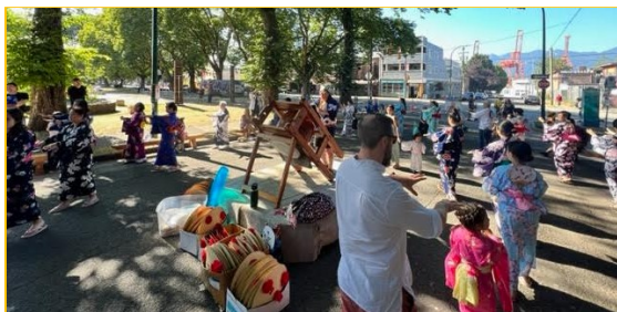
2023 Bon Odori