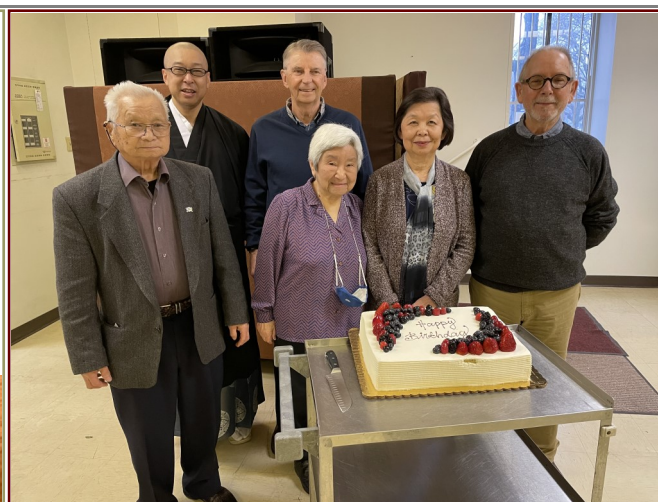
2023 Keirokai - honouring those turning 77, 88, and 99