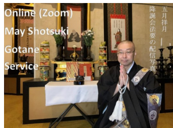
Online (Zoom) May Shotsuki Gotane Service

(Service takes approximately 30 minutes - Meditation, Sutra Chanting, and Dharma Talk)