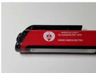
6-LED lightbar - $10.00