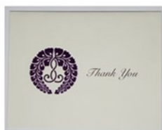
Cards - $5.00/set of 5