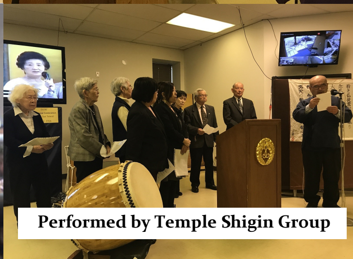
Performed by Temple Shigin Group