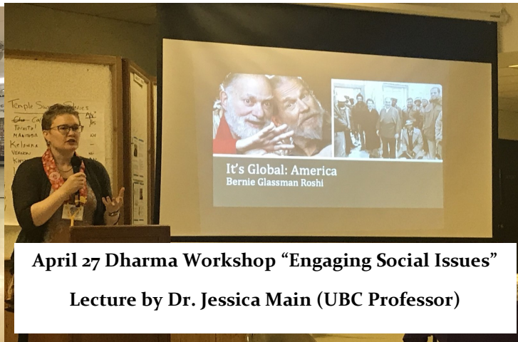
April 27 Dharma Workshop "Engaging Social Issues"