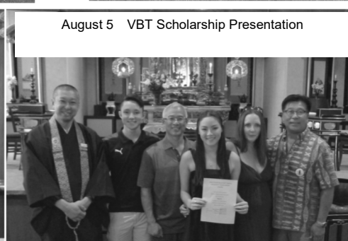
August 5 VBT Scholarship Presentation