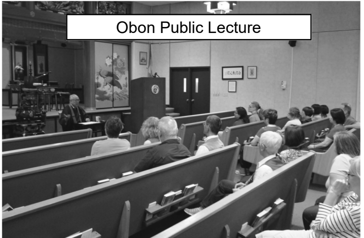
Obon Public Lecture