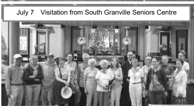
July 7 Visitation from South Granville Seniors Centre