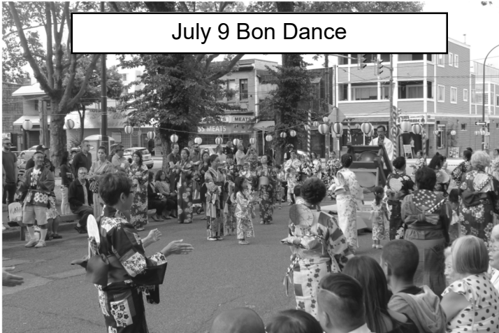
July 9 Bon Dance