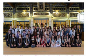
Meeting Dharma Friends from Hawaii, Buddhist Churches of America, South America, and Japan!