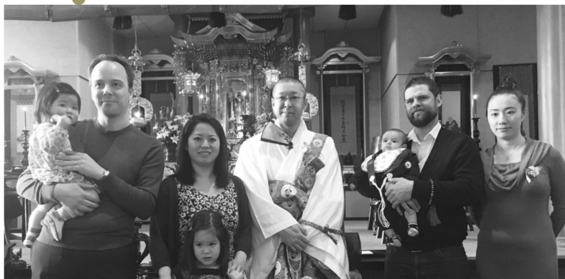
Hanamatsuri (Flower Festival) Celebration of the Birth of Sakyamuni Buddha